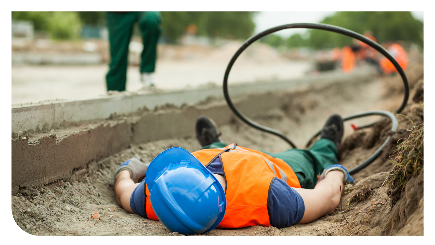
A quick accident site assessment for hazards, however, must be performed to ensure your safety before approaching the injured person.

into that tissue. If the proportion of tissue has higher resistance, then there is a higher current density, causing the electrical energy to be more focused on that area and resulting in more damage. For example, a current traveling down an arm will readily pass through a cross-section of lowresistance tissue, such as blood vessels, muscle and nerves. When the current reaches a joint, there is a larger crosssection of higher-resistant tissue, such as bone, ligaments and tendons, causing a higher proportion of damage to the joint.