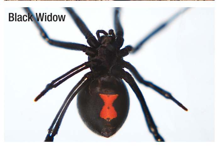
the wound. Do not drink alcohol for pain or take any aspirin, ibuprofen or naproxen.