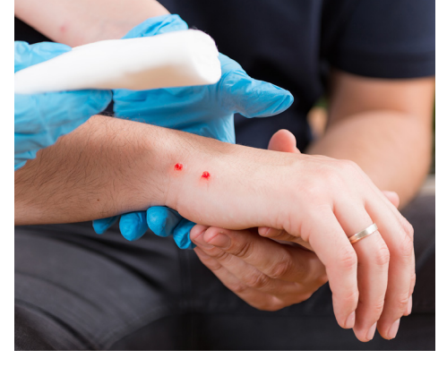
Wash the area (of the snake bite) with soap and water, if able, and cover with a clean, dry dressing.

First aid for a snake bite starts with getting medical attention fast, Call 9-1-1. Get an ambulance to transport the victim. If there