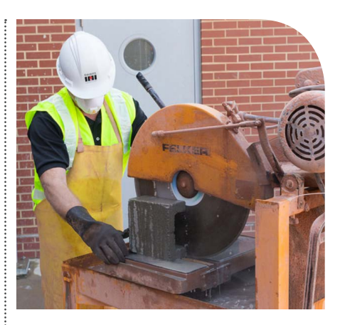
Wetting process involves using water or a foam to keep dust down and out of the air.

As with all workplace hazards, the National Institute for Occupational Safety and Health encourages using mitigation strategies to control exposure. These strategies include elimination, substitution, engineering controls, administrative controls and personal protective equipment. Eliminating crystalline silica or substituting non-crystalline silica materials would be the most effective way to reduce crystalline silica exposure risk. Two engineering controls for reducing respirable silica include the use of vacuum collectors on tools and applying a wetting process to reduce dust. Limiting the time workers are exposed to respirable silica or restricting access to areas of exposure would be administrative controls. Using PPE would be the least desirable mitigation tactic for exposure control and